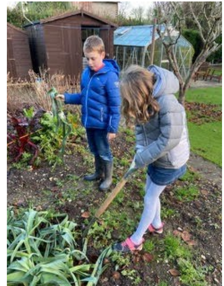
From Fork to Plate!