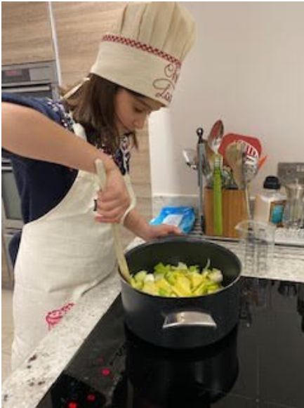
Food Tech Lessons at home